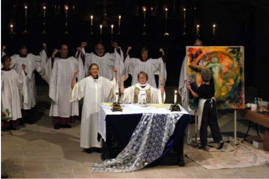
Celebration of Eucharist with American Sign Language