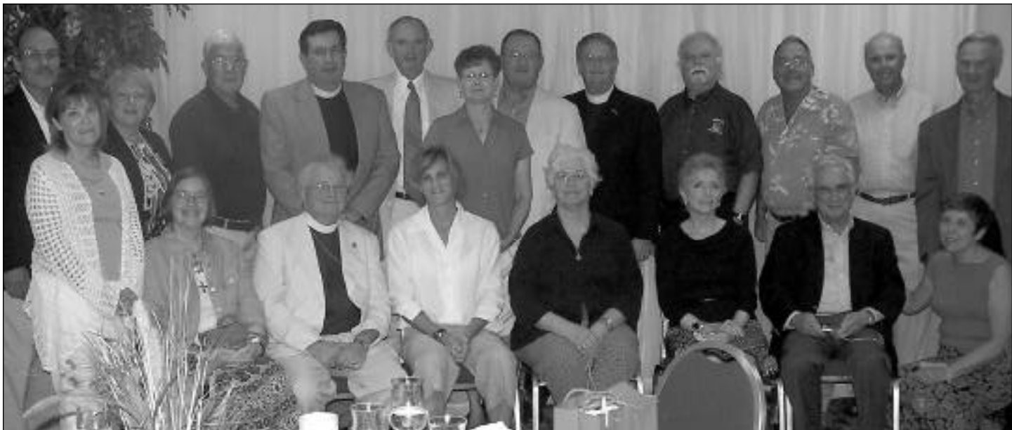
Province IV Disaster Preparedness and Response Commission meeting in Savannah, Ga.