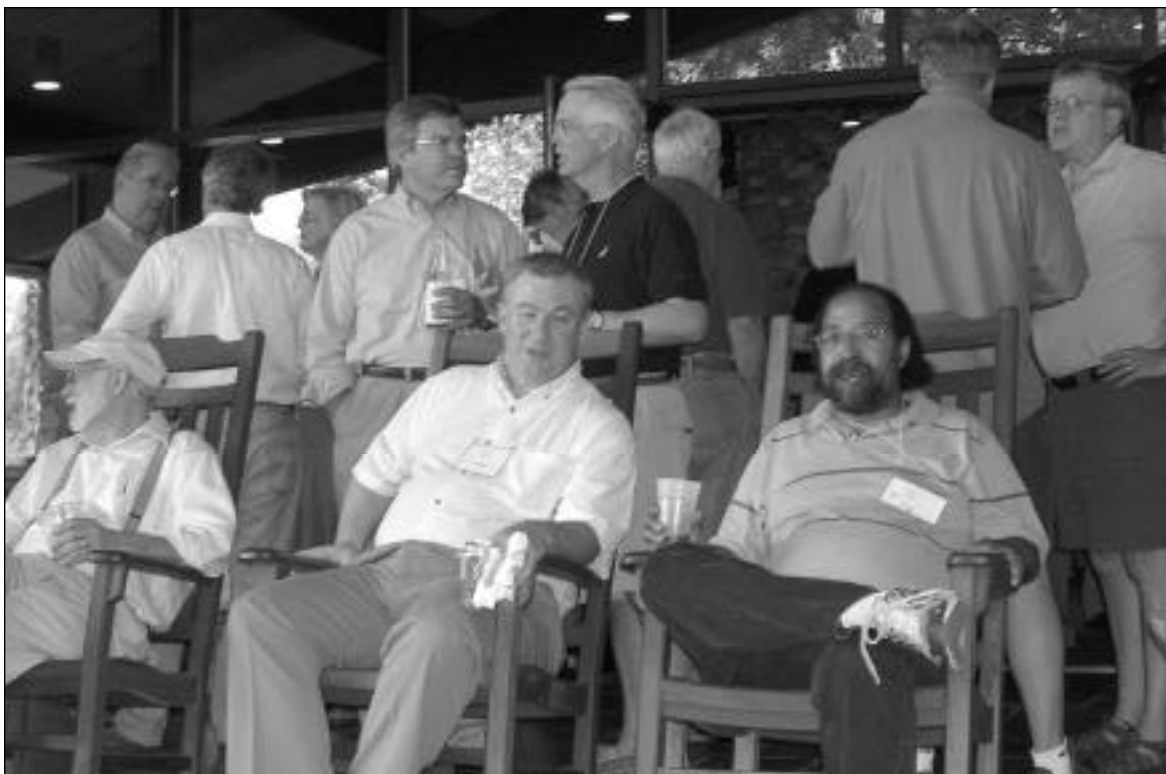
One of the joys of provincial meetings is gathering at Kanuga Conferences near Hendersonville, N.C. where the scenery and the ambiance (such as sitting in a rocking chair on the porch at the inn, left) make for a good meeting.