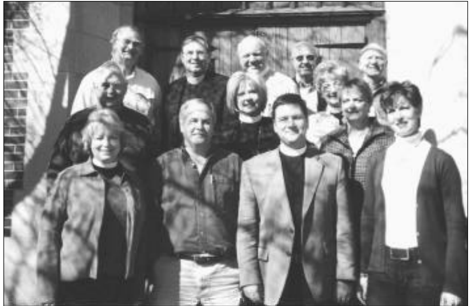
Congregational Development & Evangelism network organizes