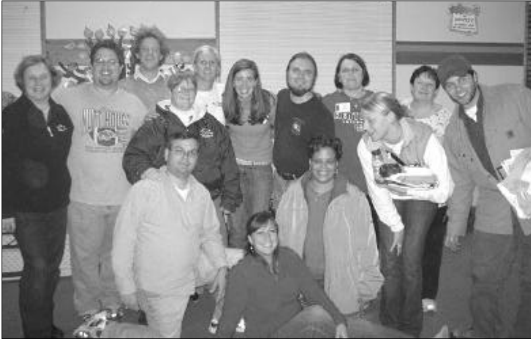
Young people and youth ministers from 15 dioceses participated in the Province IV Youth Ministries Network Meeting at The Cathedral Domain in the Diocese of Lexington.