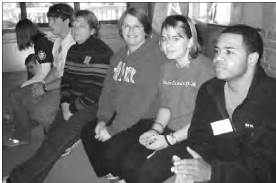
PIV Youth Ministries network met at Camp McDowell in January.