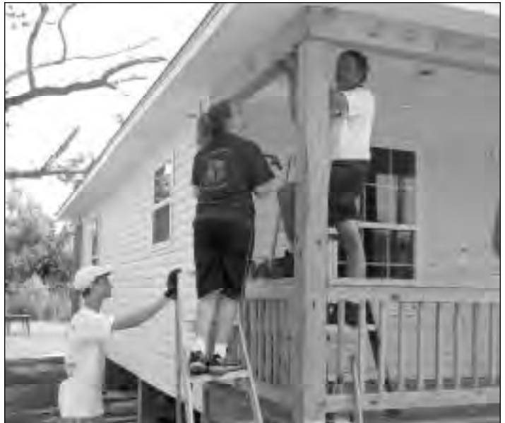
Young people work on house in Mississippi.