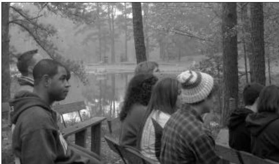
Part of the Provincial Youth Event Design Team for this summer's Appalachian mission gathering.