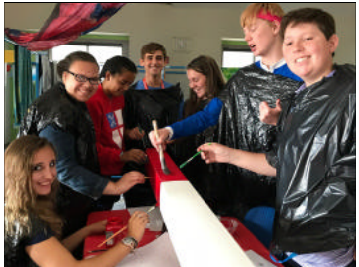
Painting posts for peace and justice