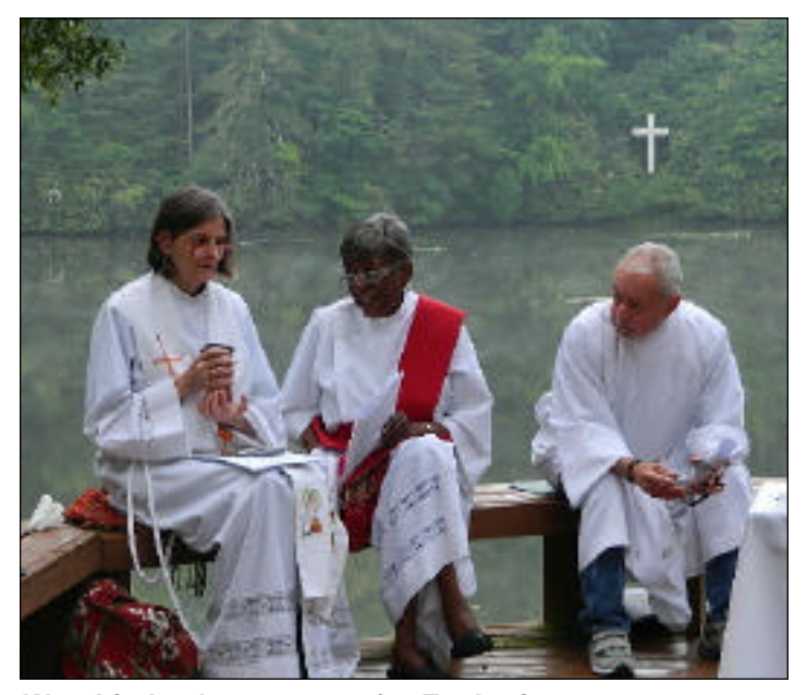
Worship leaders prepare for Eucharist