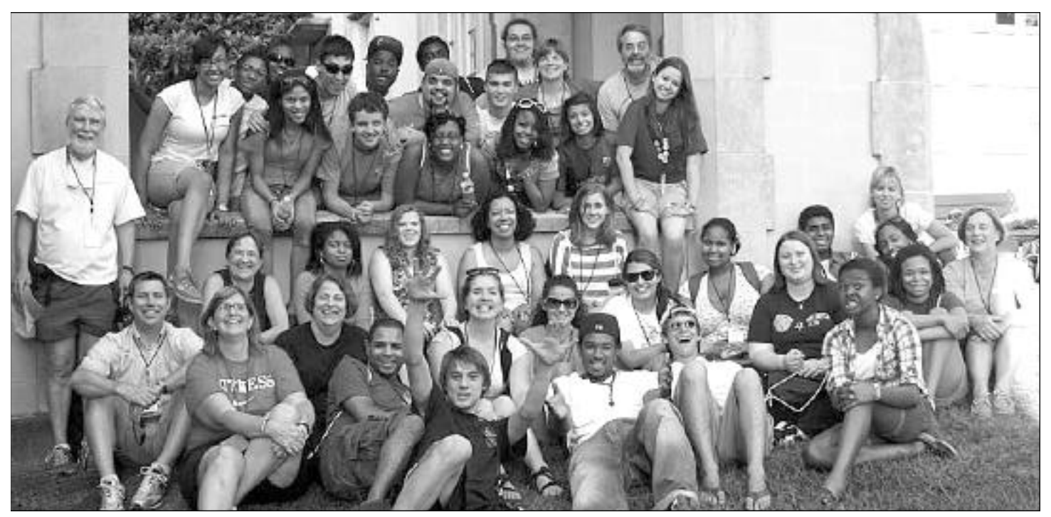
Freedom Ride, above, began in Wilmington, N.C.; below youth work in a cotton field