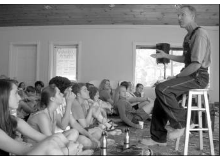
PYE youth learn about Appalachian culture in Townsend, Tenn.