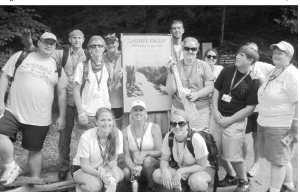
Oxford, the Civil Rights 168 youth, adults focus on God's creation at PYE 2010 in Great Smokey Mtns.

In November 2010, the Province IV Youth Ministries Network Continued on Page 9