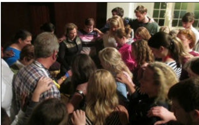
Prayers, Church of the Annunciation, New Orleans

The Province IV Diocesan Youth Coordinators Retreat will be held at Grace Point Camp and Conference Center in the Diocese of East Tennessee. The retreat will be held May 5-7 with the option of coming in on May 4. Each year the Province IV Youth Coordinators are invited to gather so they can learn