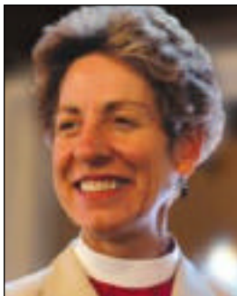
Bp. Jefferts Schori