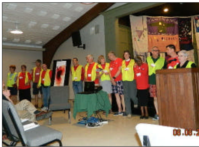
The HIV/AIDS Retreat Steering Committee