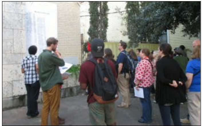
Prayers of Murdered Victims, New Orleans