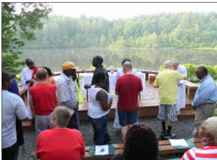
Outdoor Eucharist at last year's retreat