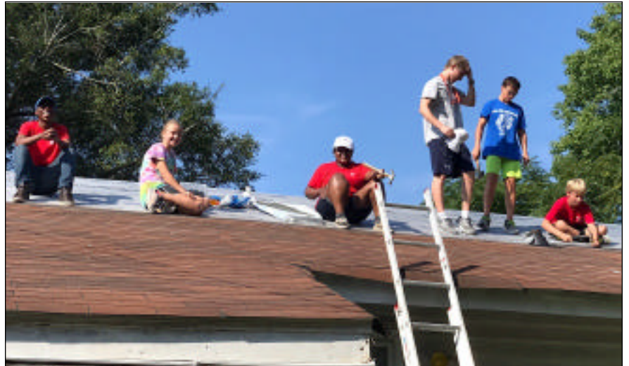
Youth working at PYE to help restore 10 homes destroyed by the flooding of Hurricane Matthew