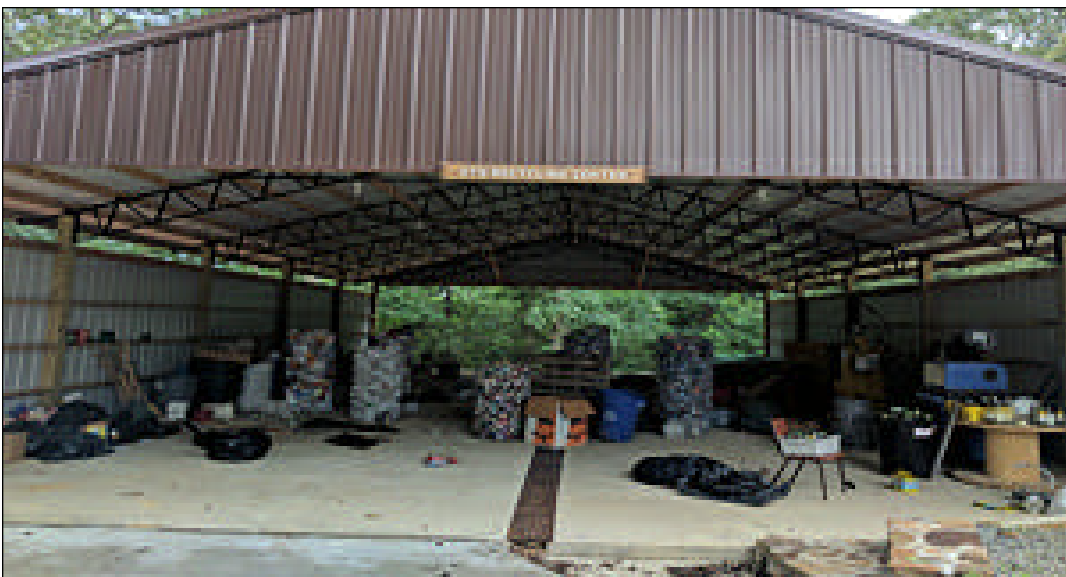
UTO Recycling Center, Camp McDowell, Diocese of Alabama