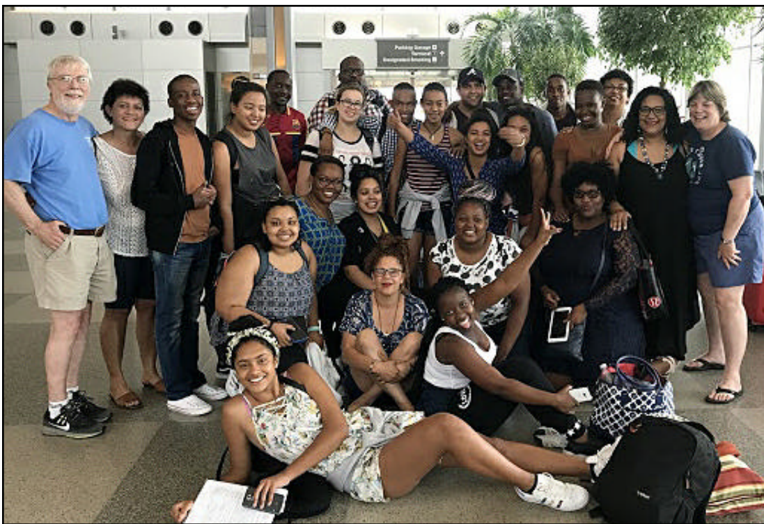
Continued on Page 5 South African and Botswana groups at airport before returning home.