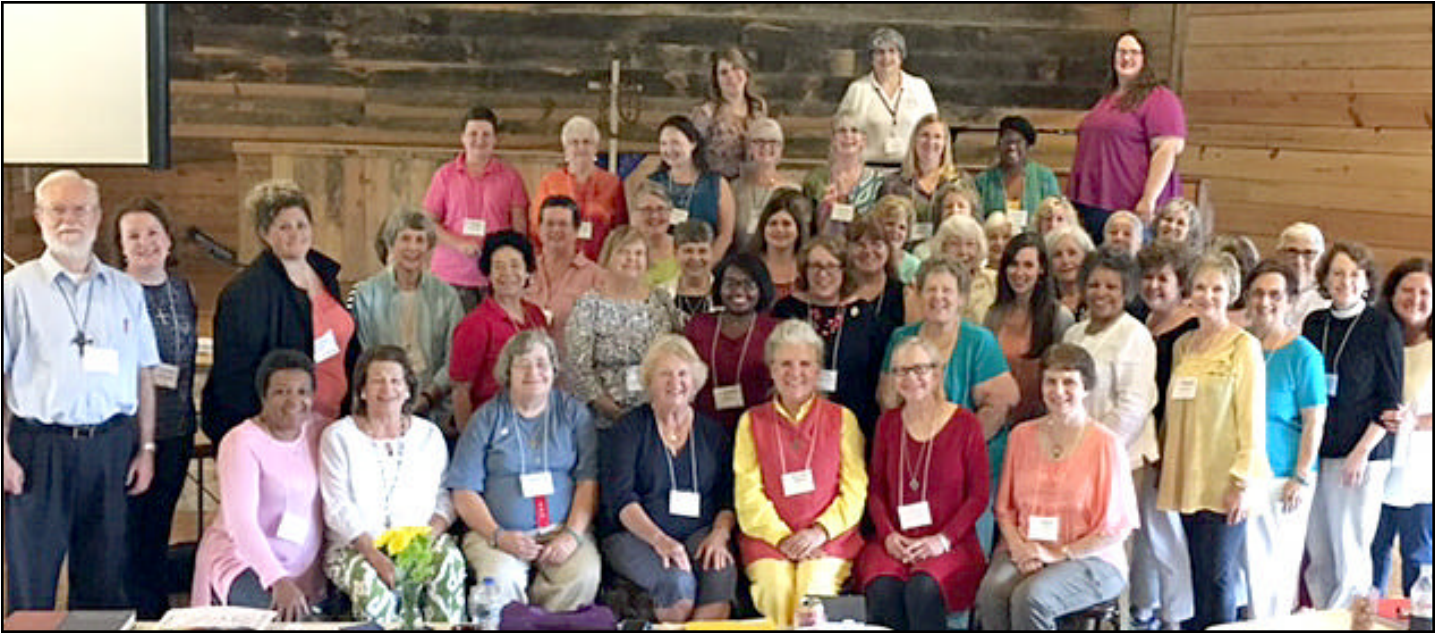
ECW participants during 2017 retreat and annual meeting at Camp McDowell