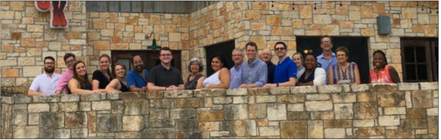
PIV participants in Young Adult and Campus Ministry Conference in Austin, Texas