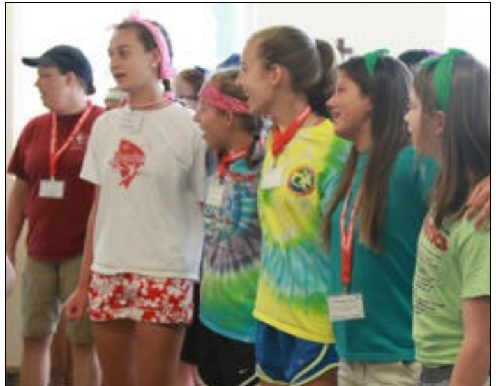
Jesus Christ with their friends, with their Church, in their communities and with the world.

Province IV Youth Ministries is following this pattern of preparation and anticipation. During the past few months, the young people and adults within Province IV have been working to create some wonderful events, mission experiences, networking opportunities and spiritual environments where we can come together to learn, share, understand and growth as the Body of Christ. This summer Province IV is offering exciting and dynamic programs and experiences that will give our young people the time and spaces to reflect on what it means to live “The Five Marks of Mission” and to engage in meaningful mission experiences that will motivate and encourage our young people and the adults who accompany them to go back to their dioceses and share the Good News of