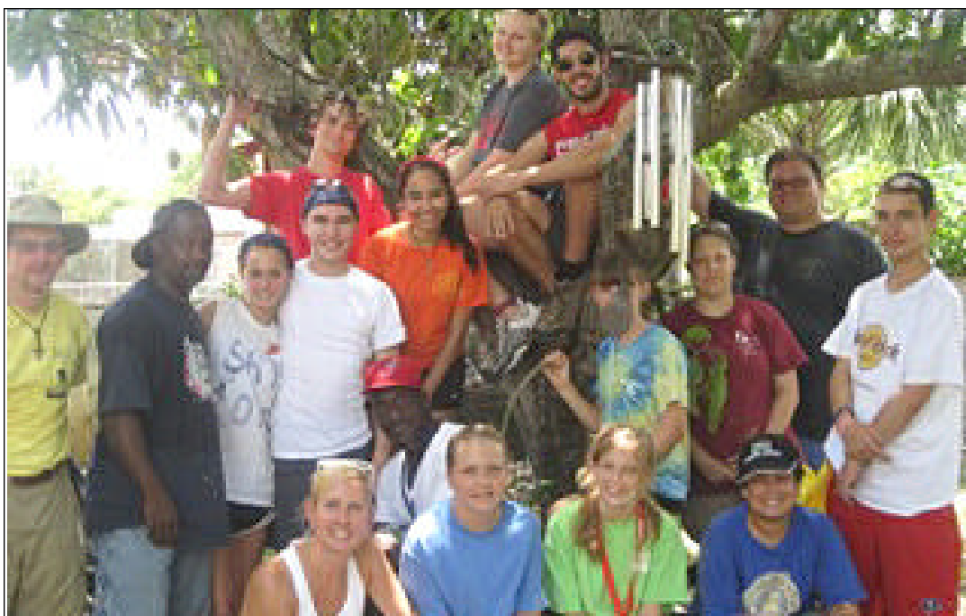
PIV Youth at last summer's mission trip to Quito, Ecuador