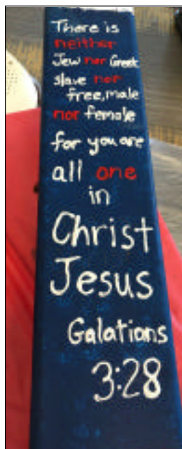
Posts: diverse, creative, collaborative

After working and serving others on various worksites and within a variety of mission opportunities, we returned to All Saints Episcopal Church to immerse ourselves in learning more about peace & social justice. Our awareness was enhanced by “ POSTS FOR PEACE ,” an organization that seeks to support and build individual and community resilience, engagement, compassion, and cohesiveness