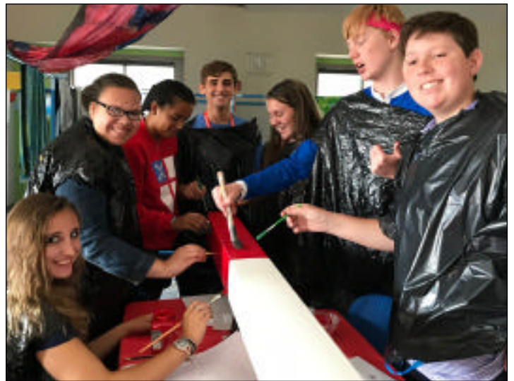
Painting posts for peace and justice